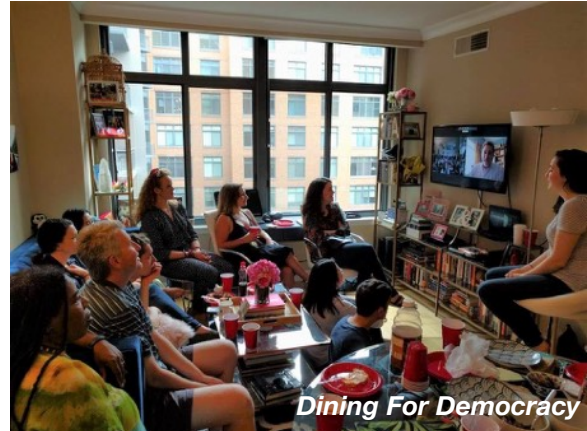
Dining For Democracy